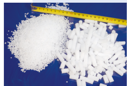
dry ice pellets

Discover more details on the reverse side!