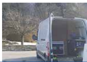
Dimensions box: 120 x 60 80 cm

The toolbox that is used to arrive fully equipped to the place of the cleaning job or to give professional demonstrations, is delivered with a complete range of personal protection material for dry ice blasting.